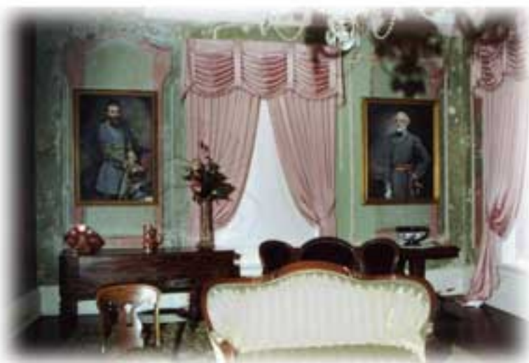
The Rose Parlor at beautiful Confederate Memorial Hall, the home and meeting place of Knoxville Chapter 89.

The UDC is the oldest patriotic organization in the United States. Its objectives are historical, benevolent, educational, memorial, and patriotic. We strive to honor the memory of those who served and fell in service to the Confederacy; to protect, preserve, and mark historic sites; to collect and preserve the truthful history of the War Between the states; to record the noble deeds of Southern women during and after the war; to fulfill the sacred duty of benevolence toward the survivors and toward those dependent on them; to assist descendants of veterans in securing an education; and to cultivate